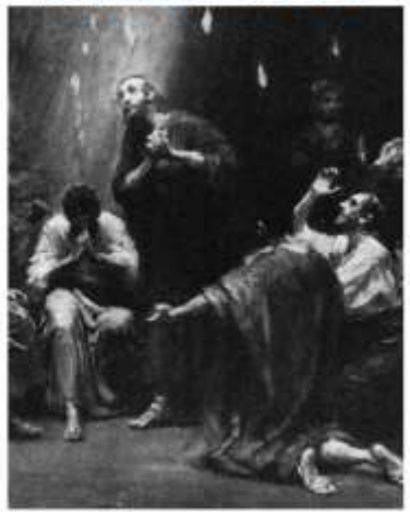
SPEAKING IN TONGUES HOLY SPIRIT VS. DECEIVING SPIRITS